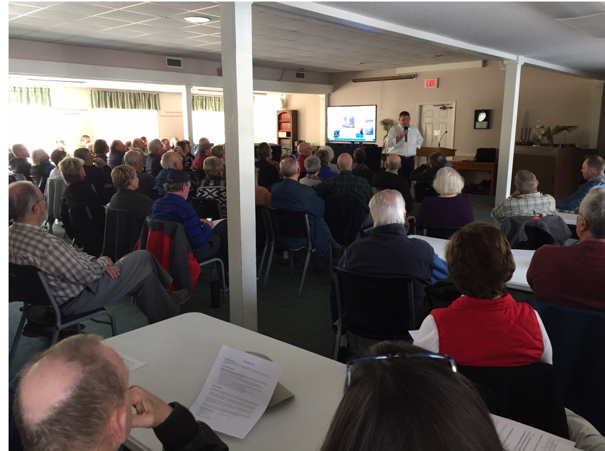
Laurel Park Public Hearing - Dec. 2018